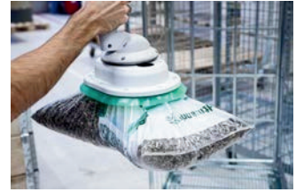
Use for automated handling on a robot or manual handling using a vacuum tube lifter